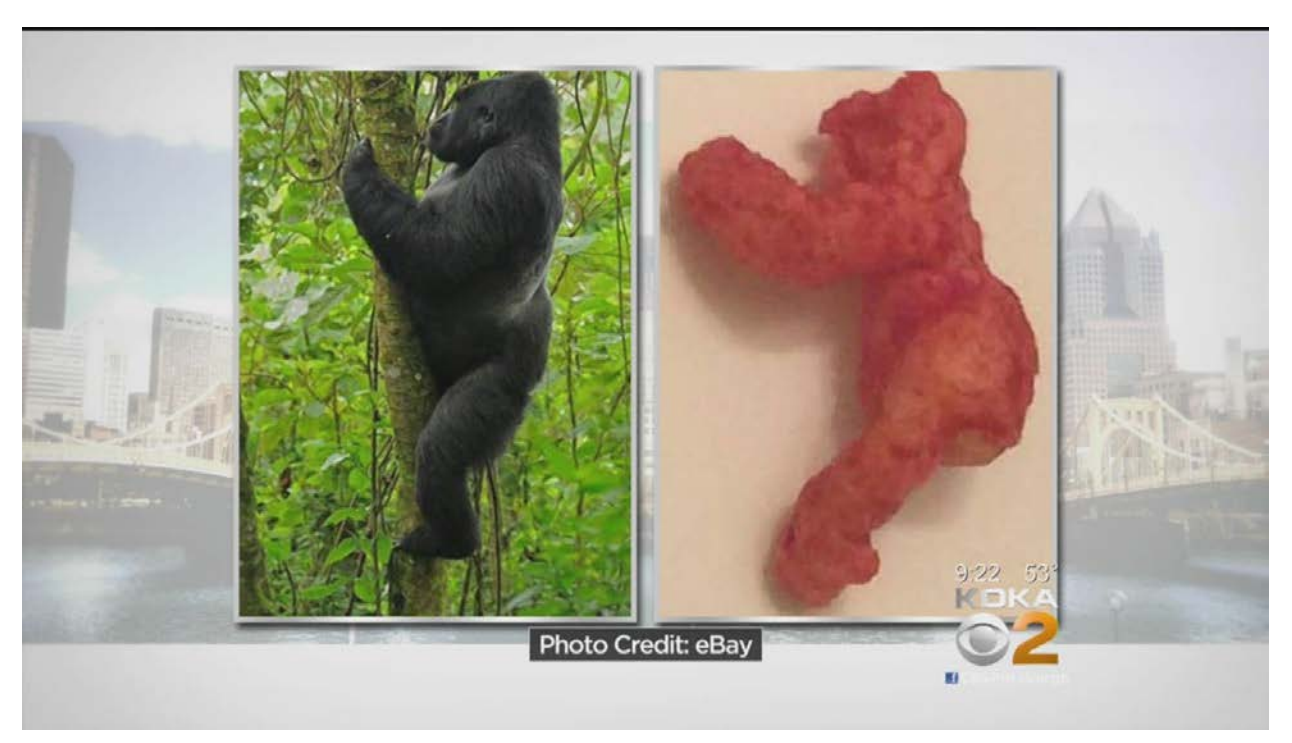
Cheeto Harambe LA Times Photo credit eBay http://www.latimes.com/local/lanow/la-me-In-harambe-flamin-hot-cheeto-burbank-manebay-20170208-story.html