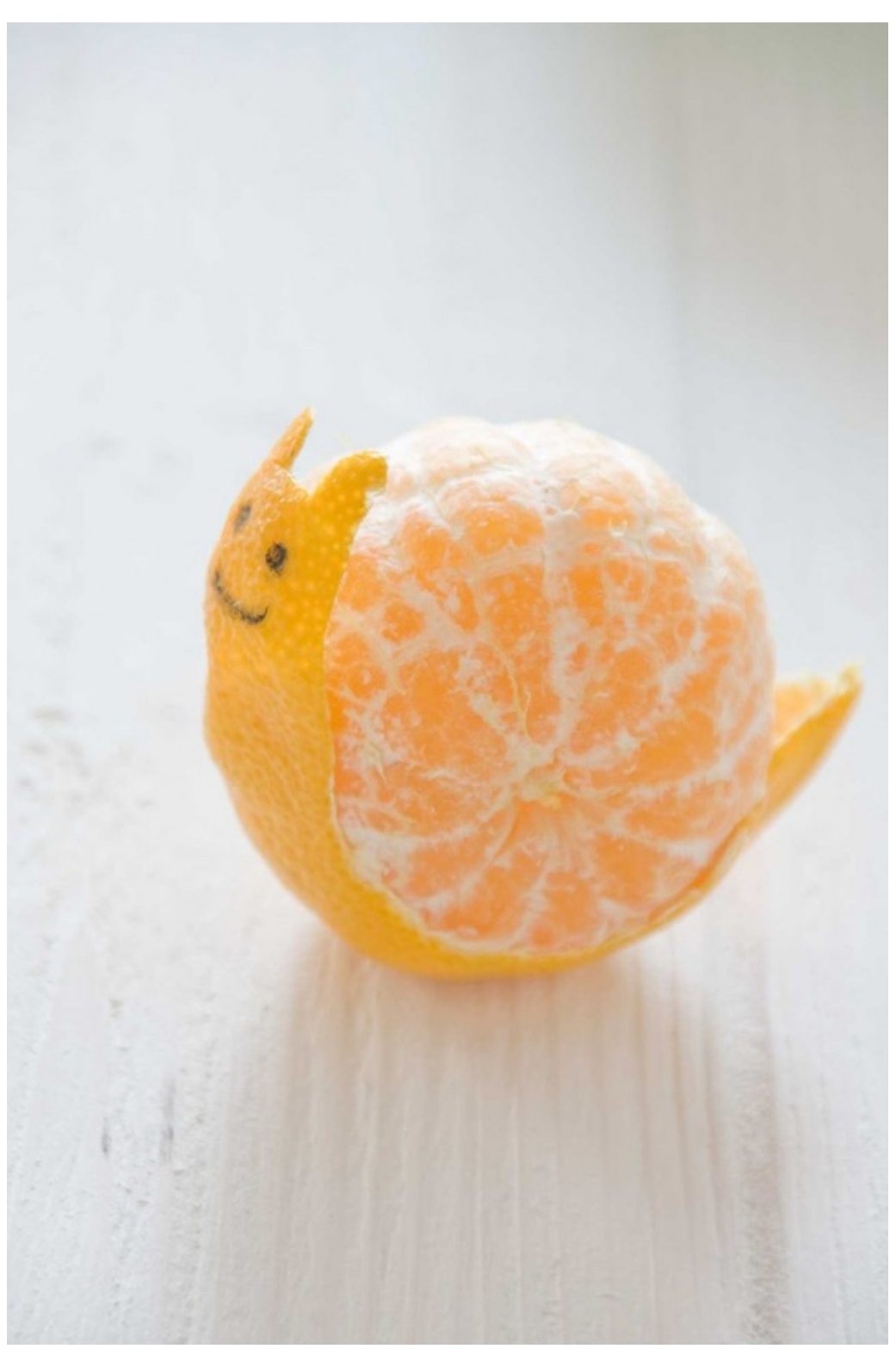
Tangerine Snail