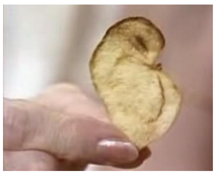
Sleeping Bird Potato Chip Still from Johnny Carson Show http://www.tvacres.com/plants_vegetables_chips.htm