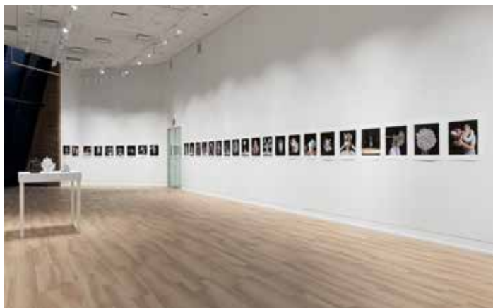
Artwork from Hillerbrand + Magsamen: The Devices Project on display.

Galleries closed early due to COVID-19 and reopened October 3, 2020