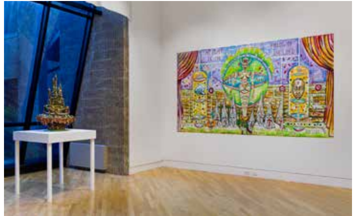
Artwork from Kevin Blythe Sampson: Black and Blue on display.