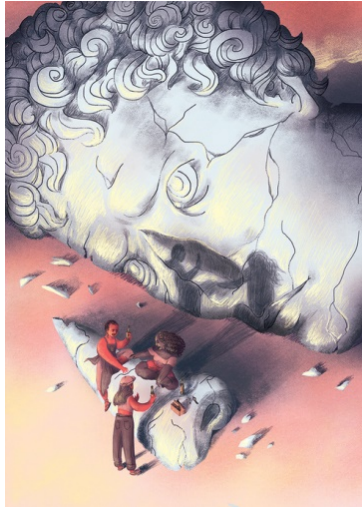
By Colleen Tighe